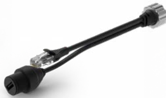
Cable PoE-USB – 5m