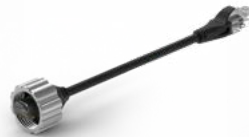
Cable PoE – 5m